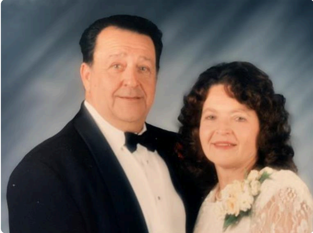
Dad and Mom